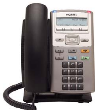
IP Phone 1110

The award-winning Nortel IP Phone 1110 brings a new realm of capabilities to the standard-level desktop IP Phone. Designed to meet general-purpose communication needs, the single-line Nortel IP Phone 1110 delivers innovative new features including support for data and Web-centric applications presented on its graphical display. Menu and application navigation are flexible, with a built-in four-way navigation cluster. An integrated 10/100 Ethernet switch with LAN and PC ports enables single cable drops to the desktop, reducing infrastructure costs. Combined with robust and tightly linked communications features from Nortel Communication Servers, Nortel's IP Phone 1110 delivers the key capabilities needed for today's business environments.