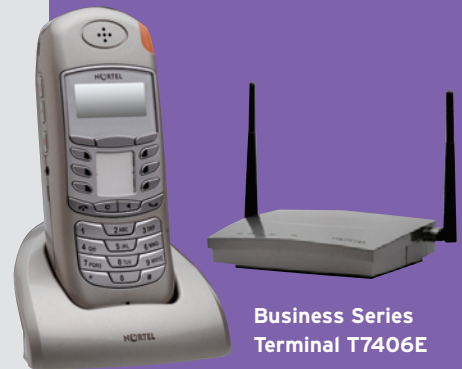
Business Series Terminal T7406E

* This product is available in North America, Mexico and Caribbean countries (except for Jamaica and Trinidad) only.